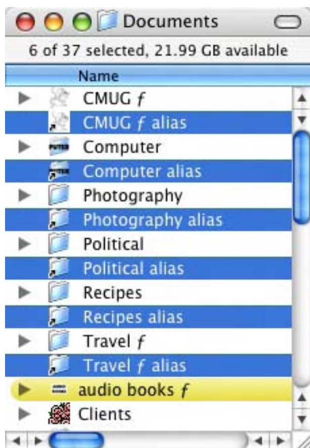
Fig. 1. Aliases of folders

Now go to your user folder (Users | username) and scroll down to theLibrary and find the PDF Services folder. If there isn't one, make one. Drop your alias folders here, Fig. 2. There may already be items in your PDF Services folder for other purposes. For example, if there is a Mail alias in the folder, it lets you attach the PDF to a new blank email, ready to send. You might want to alias Mail for this purpose.