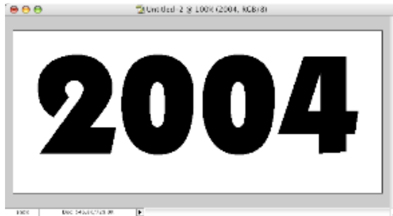
Fig. 1 New document with text inserted

Use a blocky sans serif font. I love Boulder. Type your text. I have chosen to use 2004 as my text, Fig. 1.